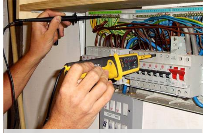
Completing electrical installation testing as per BS7671